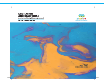
Migration and Diasporas An Interdisciplinary Journal

Migration and Diasporas: An Interdisciplinary Journal is a biannual peer reviewed journal of Global Research Forum on Diaspora and Transnationalism (GRFDT)